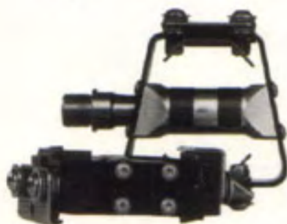
Mountain... Cross... or Road

Ultra-light and durable 7075 T-6 aluminum. Four position adjustable pivot point dramatically increases braking power and modulation. Separate perches available for RAPIDFIRE PLUS shifters.