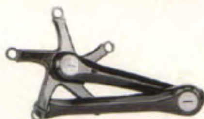
Mountain... Compact — Road... or Tandem

Top and/or bottom clip-in configurations. Free-float rotational design saves knees. Low-profile aluminum cleat with replaceable inserts. Durable 7075 T-6 aluminum body and cage. Adjustable release tension. Ultra-light 6AL-4V titanium spindles.