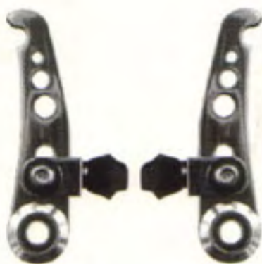
Original Speed Controllers — or Mag Lites

Easiest single bolt adjustment. Sealed against the elements like no other brake. Lighter with pads than most brakes without pads. Oil or grease injection ports. Interchangeable pad compounds for dry, wet or muddy conditions. Never buy another brake pad — just replace it with new plugs. Complete brake pad assembly available separately as upgrade to any other brake.