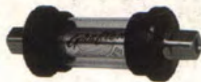
Mountain... or Road

Ultra-light 7075 T-6 aluminum. Spider is integral to crank arm. 170, 172.5, 175, 177.5, and 180 mm lengths.